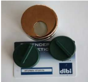
Kit defender "Key Protector" with keys and card